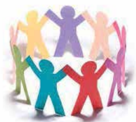
CIVIL SOCIETY ORGANIZATIONS