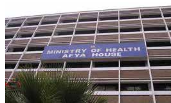
NATIONAL LEVEL MINISTRY DEPARTMENTS & DIVISIONS