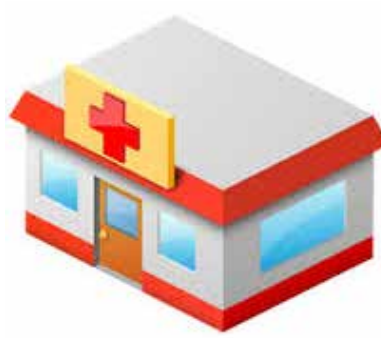
COUNTY & DISTRICT HEALTH MANAGEMENT UNITS