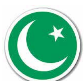
FAITH-BASED HOSPITALS & HEALTH FACILITIES