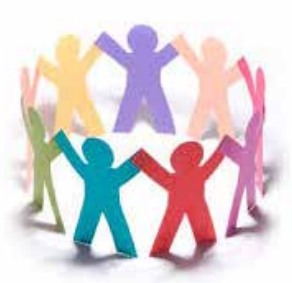
NATIONAL CIVIL SOCIETY, FAITH-BASED AND NON GOVERNMENTAL ORGANIZATIONS