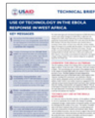
Use of Technology in the Ebola Response in West Africa