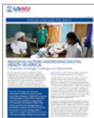
Regional Actors Addressing Digital Health in Africa: Comparative Advantages, Challenges and Opportunities