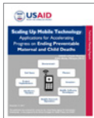
Scaling up Mobile Technology: Applications for Accelerating Progress on Preventable Maternal and Child Deaths