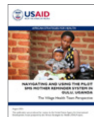
Navigating and Using the Pilot SMS Mother Reminder System in Gulu, Uganda: The Village Health Team Perspective