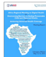
Africa Regional Meeting on Digital Health for Overcoming Barriers to EPCMD and Achieving UHC: Meeting Report