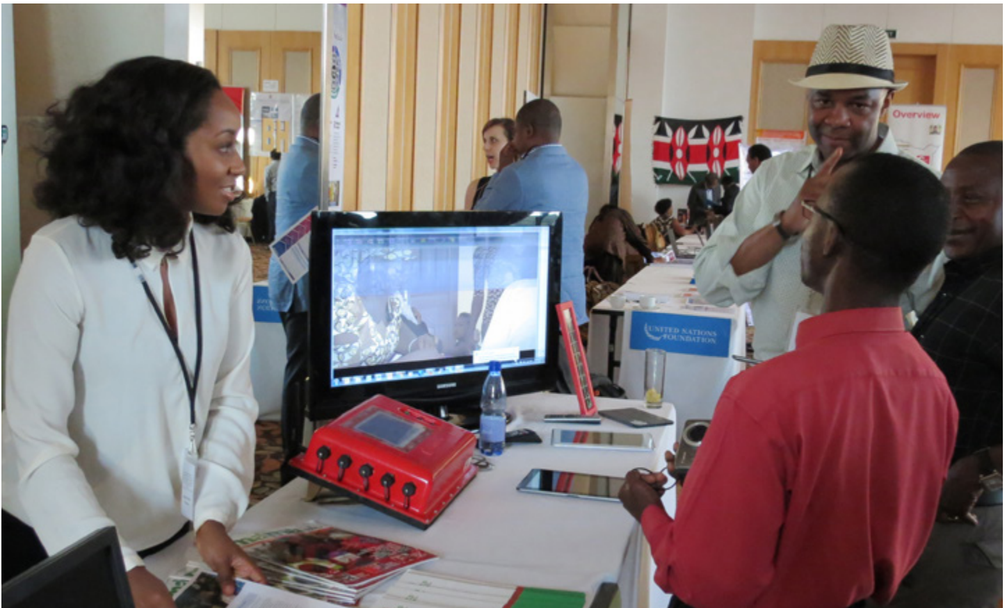
Participants at the Africa Regional Meeting on Digital Health, Lilongwe Malawi, May 2015

In cases where digital technology replaces a similar standard method (such as the use of mobiles or tablet-based data collection rather than paper-based) the difference in cost, timeliness, and quality of results is perceived to be understood. MHealth and digital health are not monolithic, the terms encompass a range of potential applications, many of which are not just replacing a standard operating method, but are