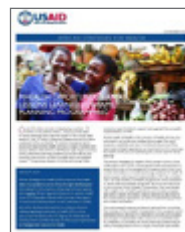
mHealth Opportunities and Lessons Learned for Family Planning Programming