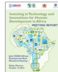
Investing in Technology and Innovations for Human Development in Africa: Meeting Report