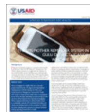
The SMS Mother Reminder System in Gulu District, Uganda: What are the Costs?