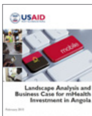
Landscape Analysis and Business Case for mHealth Investment in Angola