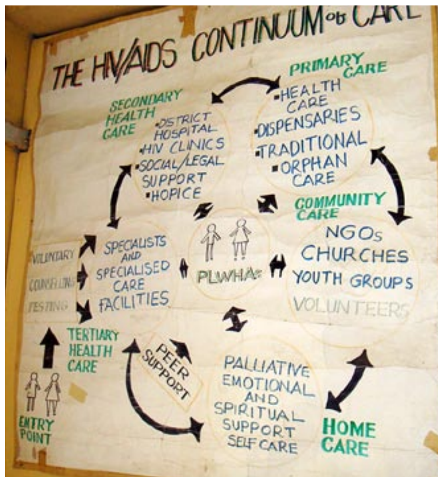
Hand-drawn poster of client-centered continuum of care and entry points into clinical and community services.

CBO staff and networks of full-time and part-time volunteers establish and maintain relationships with staff in health facilities. Some of the volunteers are active or retired healthcare workers, and they provide training on interpersonal communication and stigma reduction for health workers. In addition to being involved in client care, many volunteers are engaged