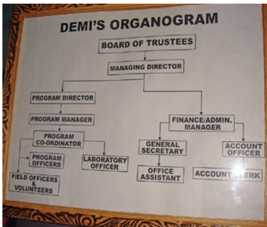
Example of an organogram developed and implemented by a local CBO, Oyo State.

to possess components of good management: paid staff, planning, internal supervision, and capacity for resource mobilization and monitoring and evaluation (M&E). The three that did not fulfill these criteria had no paid staff, though they managed a cadre of volunteers. The quality and effectiveness of the management components were beyond the scope of the study.