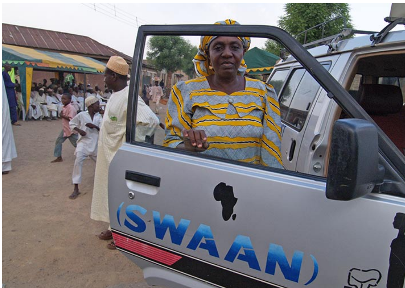
Scene at a community mobilization rally in Kano.

of TB/HIV collaborative activities, with the aim of enhancing linkages between DOTS centres, ART sites, and the support groups. However, no further detail was provided on how this was done or how information on CBO involvement will be collected and reported. ■