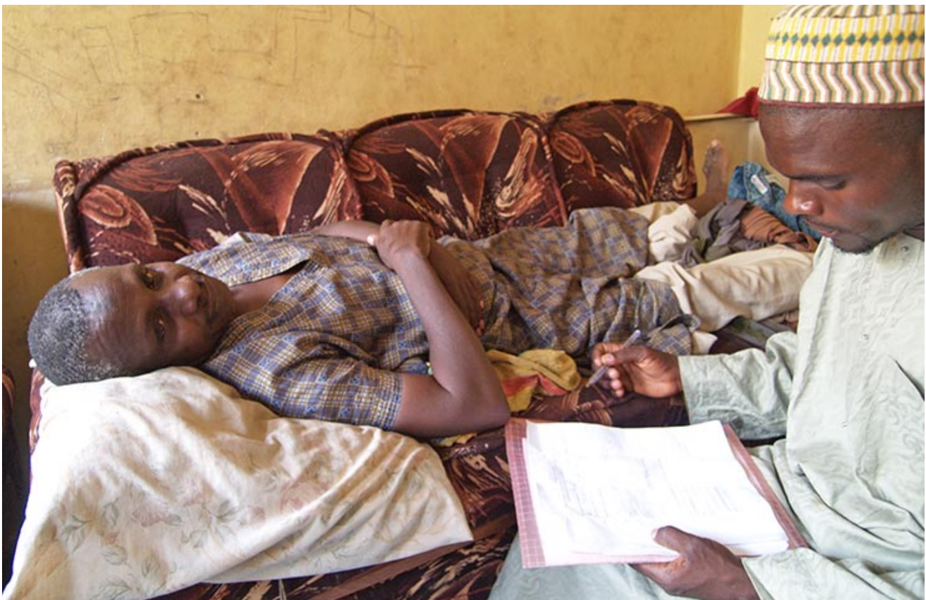
A PLACO volunteer caregiver assists a client in his home in a village in Kano State.

The study team comprised one senior international TB consultant and three Nigerian professionals: a state-level TB and leprosy coordinator; the deputy director of the National TB Training Institute; and the executive director of the Society for the Prevention and Eradication of Tuberculosis in Nigeria (SPETBN), who serves on executive committee of the GFATM Country Coordinating