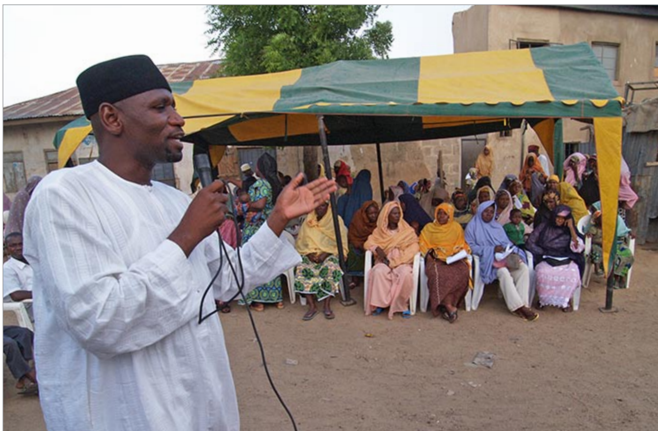
Community mobilization rally in Kano organized by SWAAN.

Among the practices or sets of actions currently being undertaken by the 12 CBOs that could accelerate