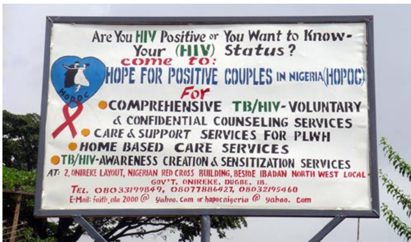
Billboard in Ibadan, Oyo State.