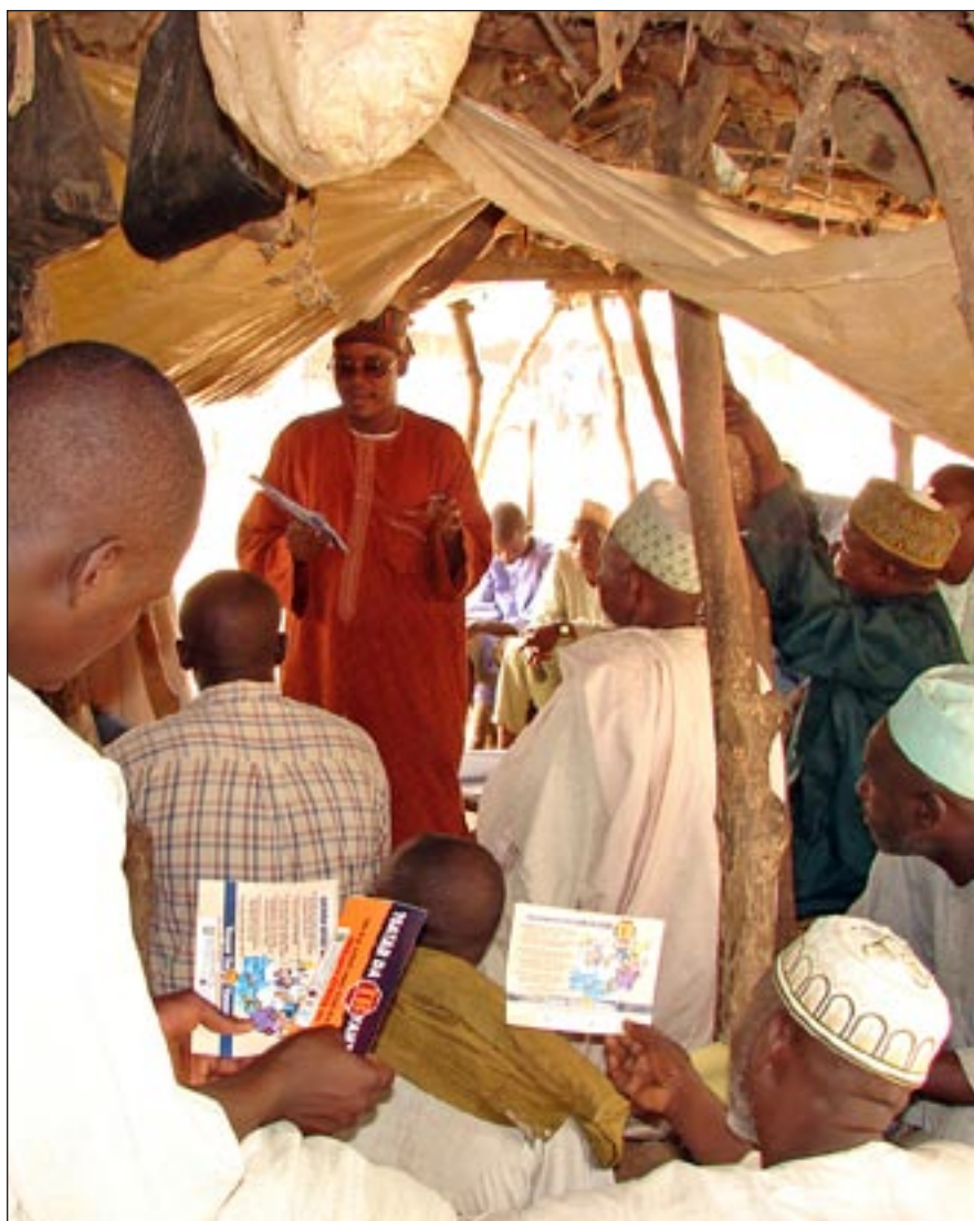
Community TB mobilization, Deidei Cattle Market, Abuja.

Umbrella organizations with long presence in communities usually have clear mandates, as well as delineated roles and responsibilities vis-à-vis networks and partner organizations. When they have strong relationships with national, state, and local networks, they ensure coherent strategies and implementation of policies. Umbrella organizations provide technical assistance to smaller organizations; help to coordinate their networks; and provide managerial and organizational support, mentoring, and supportive supervision. These organizations