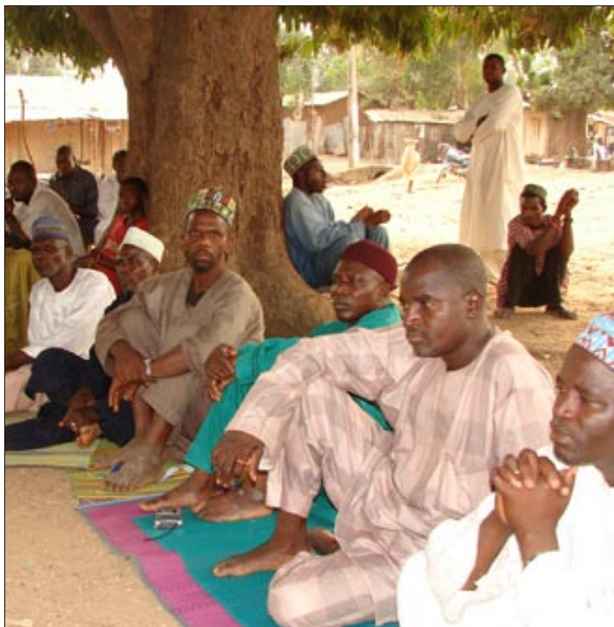
Community TB mobilization, Abuja.

Notwithstanding, few articles in peer-reviewed journals describe how CBOs working in HIV/AIDS have been employed to scale up TB/HIV collaborative activities. 4