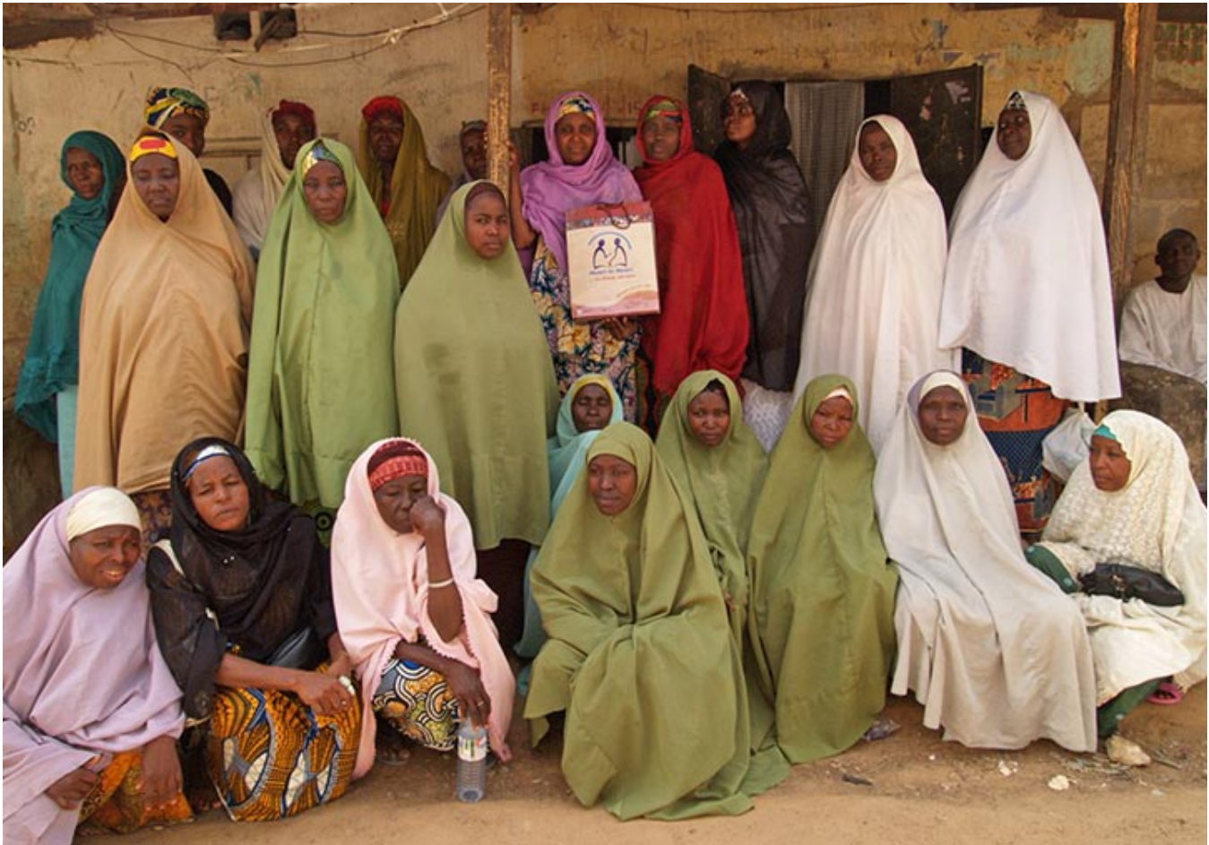
PLACO volunteer caregivers.

The work of CBOs is often adapted to local cultural environments and to significant gender issues. Often female volunteers work with women, reaching many who have limited access to information, support, and services.