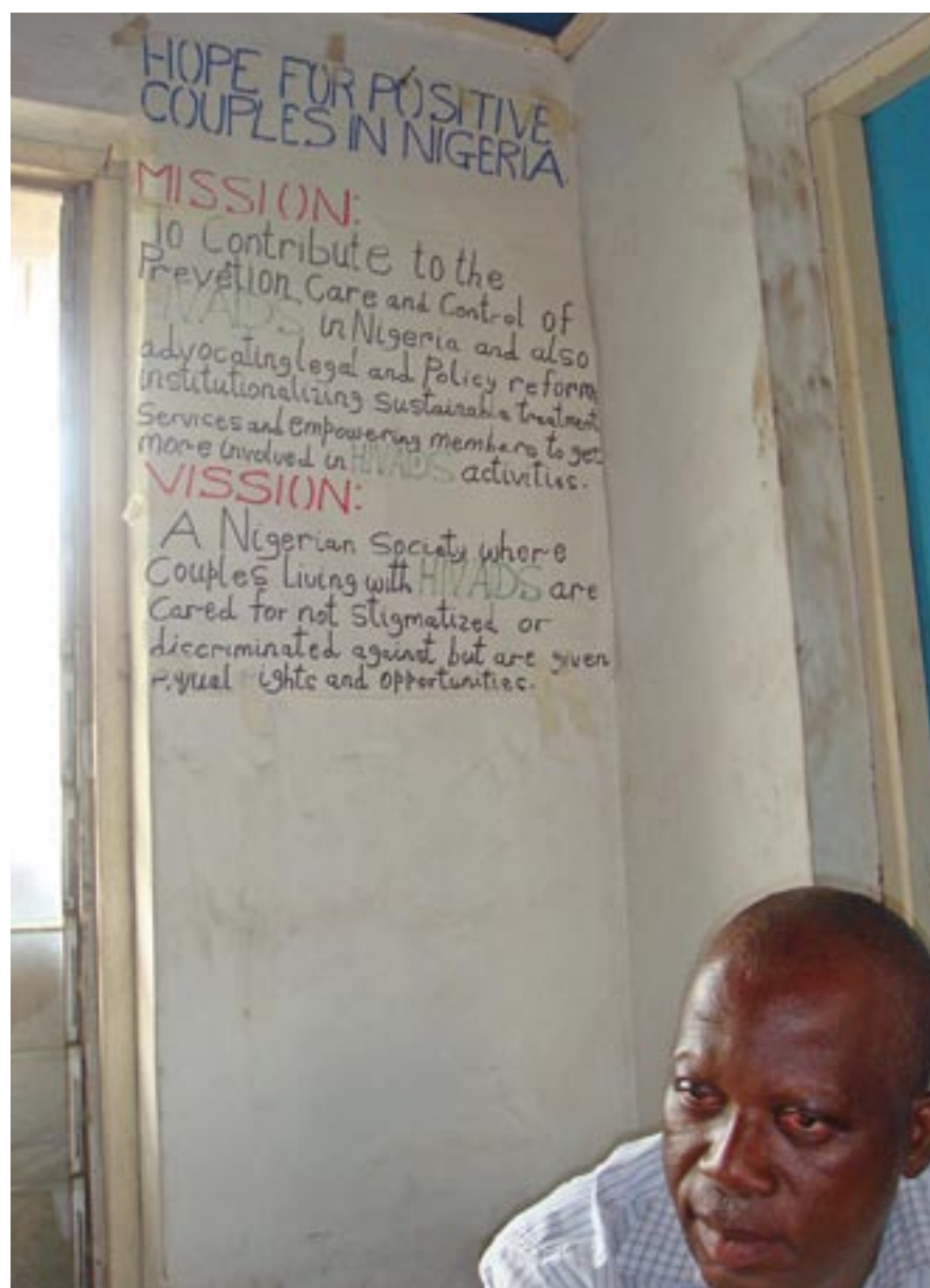
Hope for Positive Couples, an NGO in Ibadan, Oyo State.

In many countries, a significant proportion of healthcare is provided through CBOs, NGOs, and faith-based organizations (FBOs), whose collaboration with public health systems can vary greatly. Many of