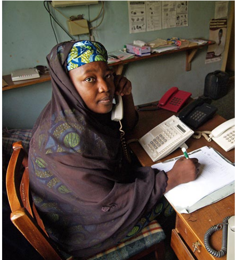
A SWAAN hotline volunteer.

Only one large umbrella organization reported that it participates in meetings of TB/HIV coordinating bodies at state and LGA