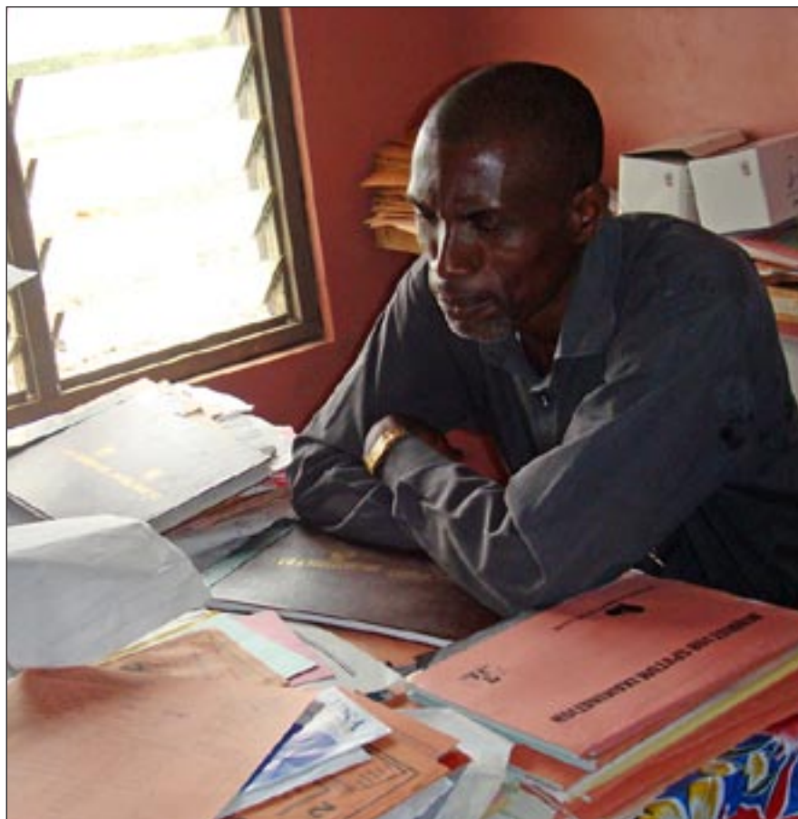
Many CBOs maintain and update records on their clients and refer them for TB screening and follow-up.

Government policy on care and support of dually infected patients has