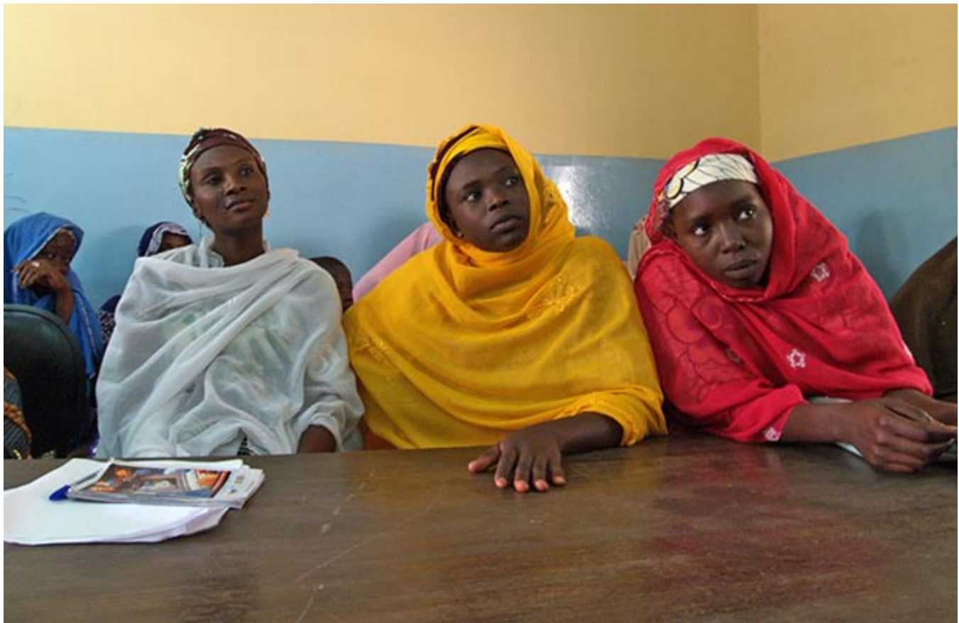
Support group meeting at Muritala Mohammed Hospital, Kano State.

community and congregate settings; and in training community health workers and health professionals in addressing issues such as stigma.