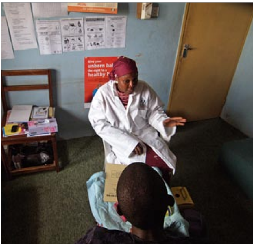
SWAAN counselor with a client.

The HAST model provides integrated care for HIV/AIDS, STIs, and TB at primary health centers and in communities. Tools and