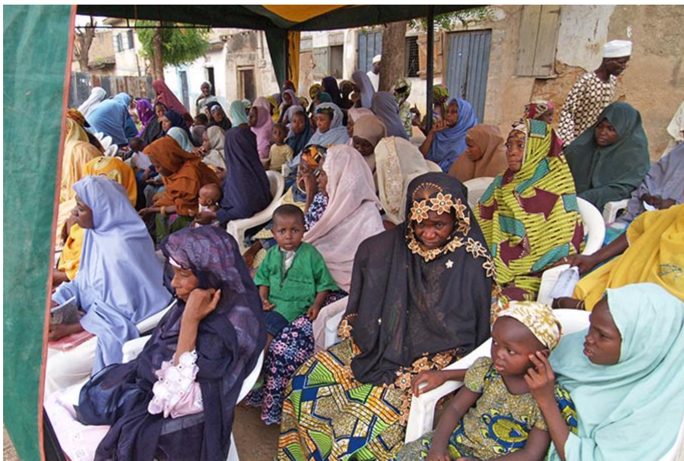
SWAAN community mobilization rally in Kano.

the actions included domestic discrimination and barred access to housing. Two organizations said they had been targets of discriminatory acts. One relocated as a result and no longer advertises its services beyond its name on the office premises. Respondents also related personal experiences with stigma and discrimination; many of these involved healthcare services.