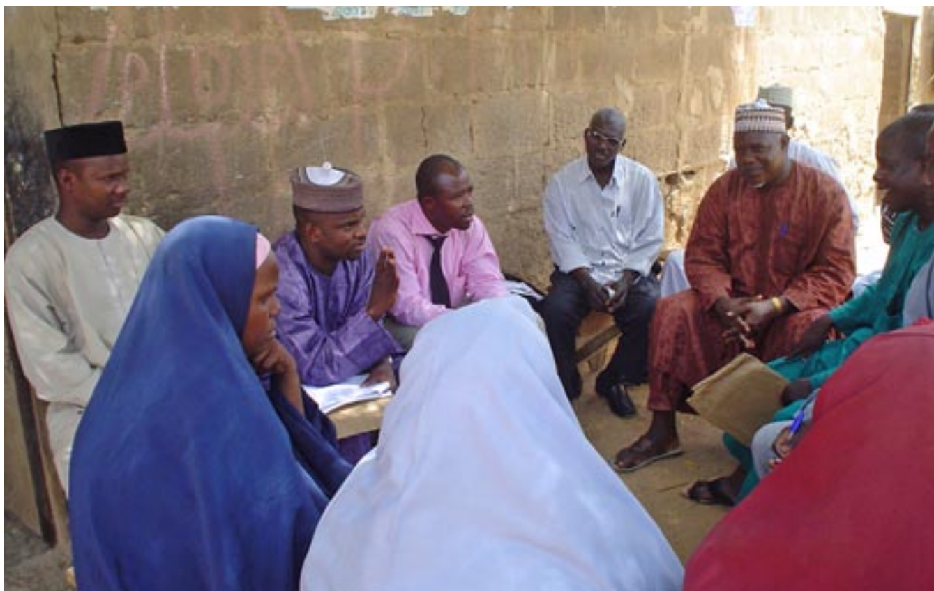
A community meeting in Kano.

factors that could hamper or support CBO implementation of collaborative TB/HIV activities (table 5).