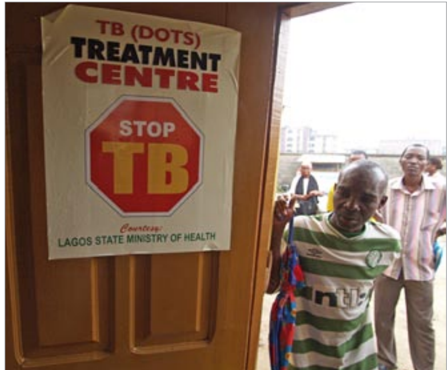
TB center at Ajeromi General Hospital, Lagos.

Nigeria was selected for this study because of its important TB and HIV epidemics. The country ranks fifth among 22 with high TB burden, and it is home to about 2.6 million people living with HIV/AIDS. Though policies and guidelines on TB/HIV collaborative activities have been developed with the support of many technical partners, the task of ensuring country-wide availability of comprehensive, high-quality, client-oriented, TB/HIV services continues to face major challenges.