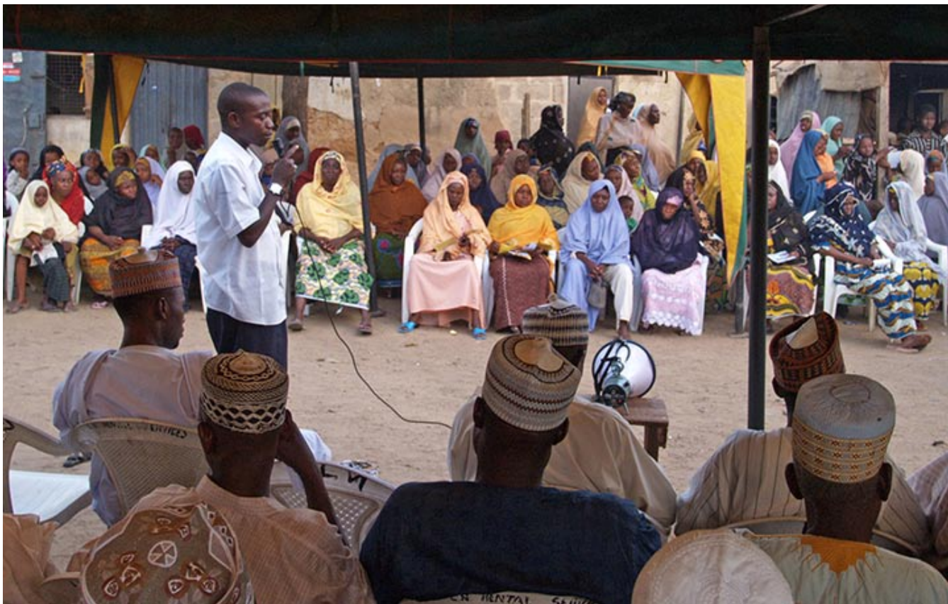
Community mobilization rally in Kano.

The HAST model has been only recently implemented in Nigeria. Among many components of interest are its systematic baseline assessments that review the availability and quality of service delivery, KAP of both clients and healthcare workers, mechanisms of coordination with broad representation, new tools for recording and referral, and its extensive training and regular supervision. Plans for monitoring the HAST model may in the future provide useful information on lessons learned with a view to scaling up.